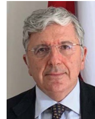
Vincenzo De Luca Ambassador of Italy in India & Nepal Rome, Italy