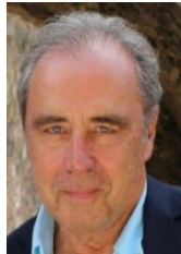
Massimo Nava Journalist & Author Rome, Italy

The war in Ukraine, the crisis in the Middle East, the operation in Venezuela, and the possible attack on Taiwan, in addition to numerous unresolved regional crises, especially in Africa, are situations that are changing global geopolitics. It is difficult to predict imminent developments, but one thing is certain: the world is seeing the consolidation of authoritarian leadership and, at the same time, the dramatic weakening of international institutions, primarily the UN. International law has been torn apart, the sovereignty of states has been broken, as the right of peoples to self-determination. The nationalist policies have already turned the page on globalization and dialogue. The risks are enormous. The most likely outcome is permanent confrontation between hyperpowers, with Europe playing an increasingly marginal role. This is the focus that will be discussed by journalist, writer, and international politics expert Massimo Nava (columnist for Corriere della Sera ) and Ambassador Vincenzo De Luca, who has had a long diplomatic career in Europe and Asia.