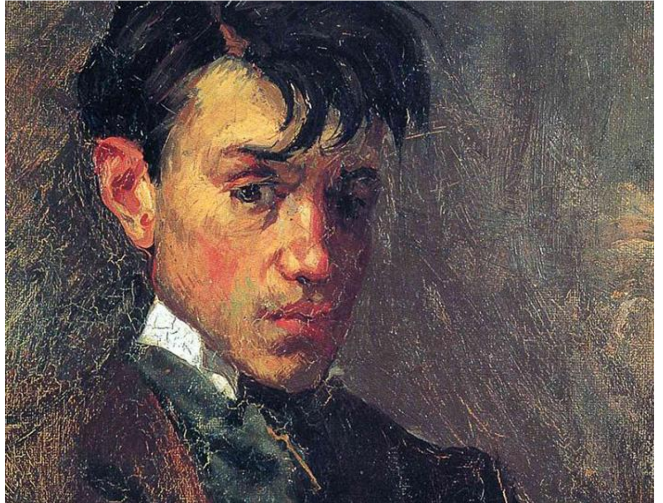
Picasso, Self Portrait at 15 Years Old (1896)