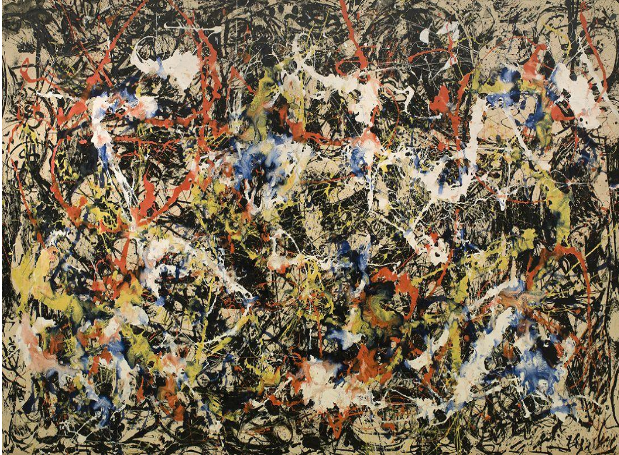
Jackson Pollock, Convergence (1952)