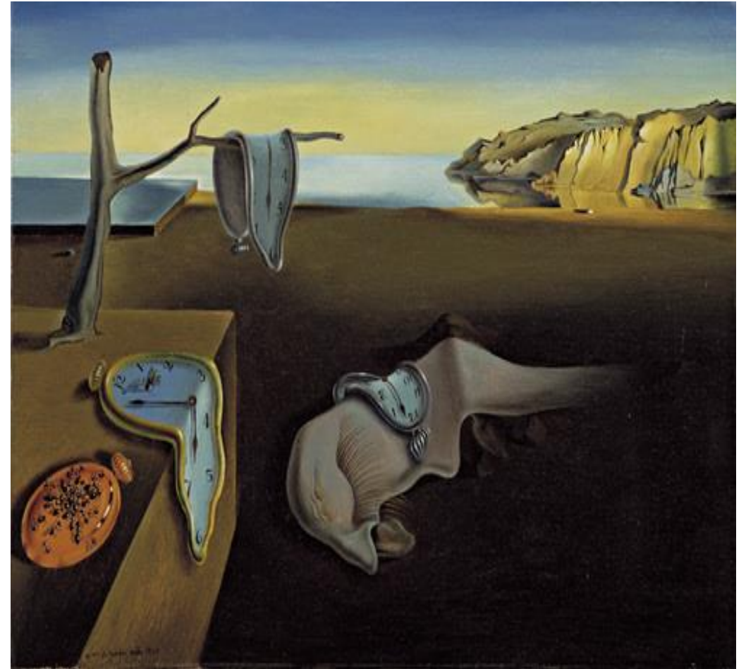
Salvador Dalí, The Persistence of Memory (1931)