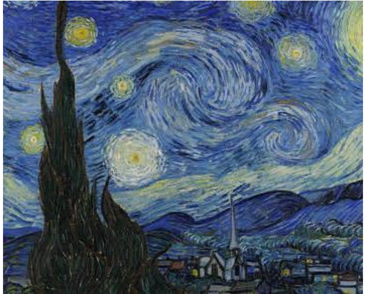
Vincent van Gogh, Starry Night (1889)