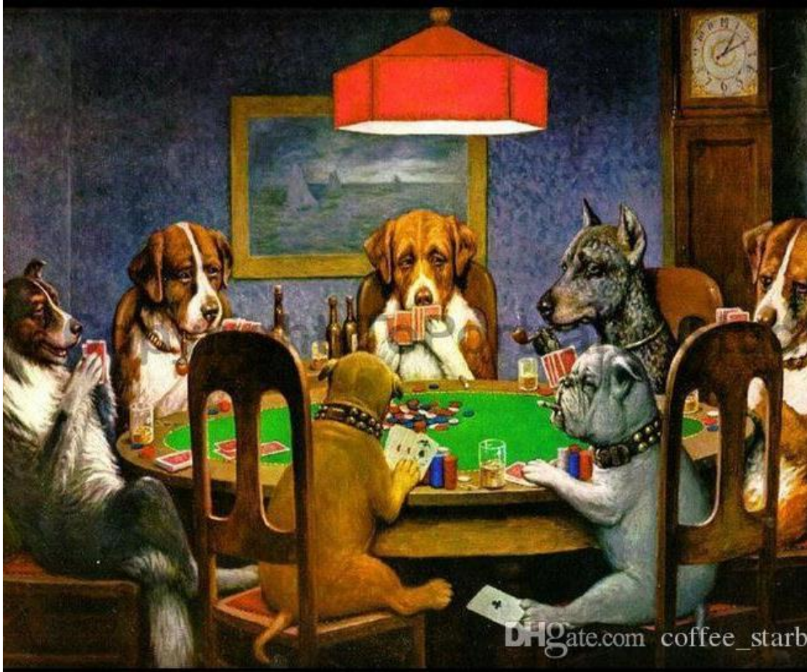
Cassius Marcellus Coolidge, A Friend in Need (1903)